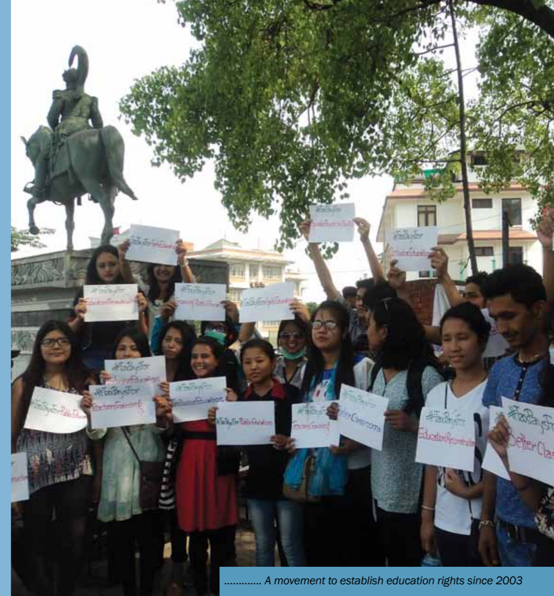
..... A movement to establish education rights since 2003