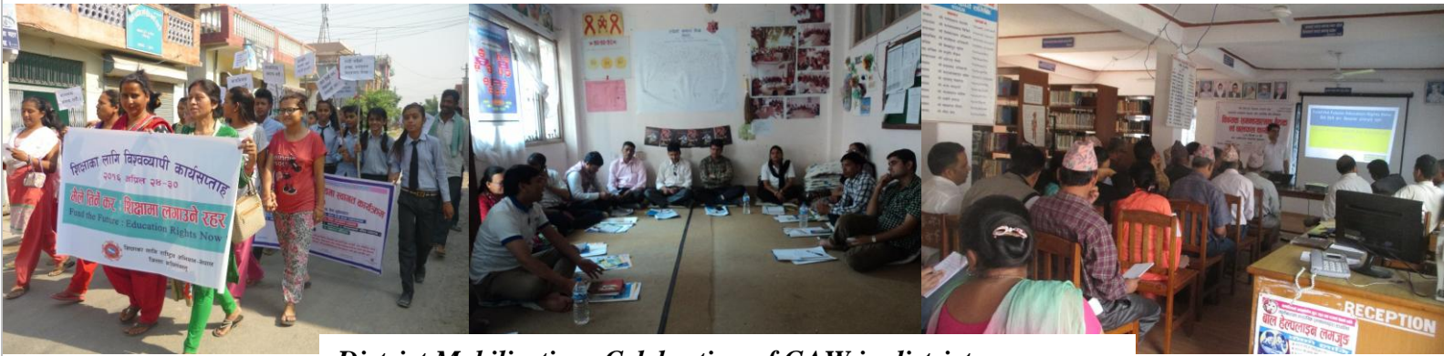
District Mobilization: Celebration of GAW in districts

financing workshop. The activities conducted were in coordination with District Education office (DEO), Civil Society Organization and other organizations related to Education.