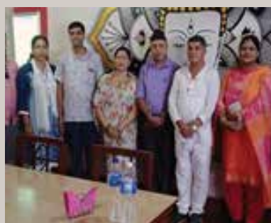
A monitoring visit at NCE DCC Morang and discussion was made on the progress and achievement along with the further strategy.