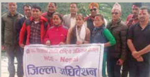
A monitoring visit at NCE DCC Kalikot and discussion was made on the progress and achievement along with the further strategy.