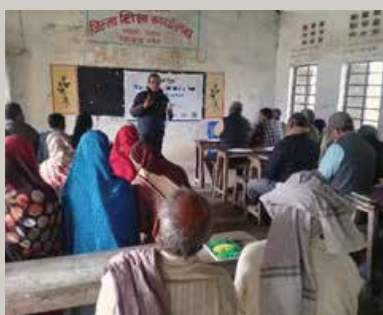
NCE DCC Mahottari conducted cluster level training on school good governance and social accountability on different schools.