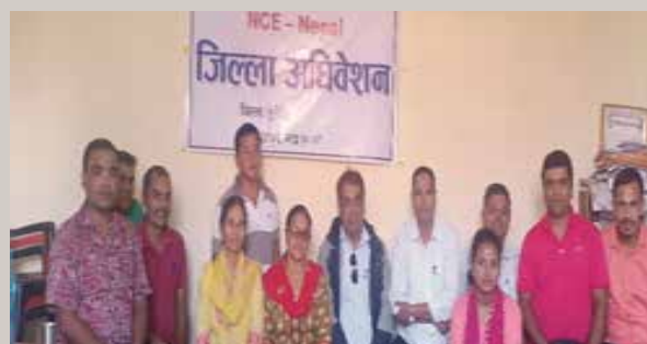
A monitoring visit at NCE DCC Surkhet and discussion was made on the progress and achievement along with the further strategy.