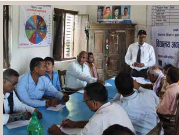
Learning sharing of best practices of schools in Dhanusha district