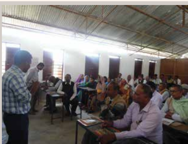
Capacity building up training for the SMC and PTA regarding their roles and responsibilities in Siraha district