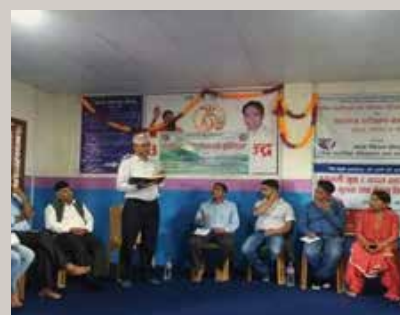
NCE DCC Kaski conducted the discourse program for ensuring the Right to Education.