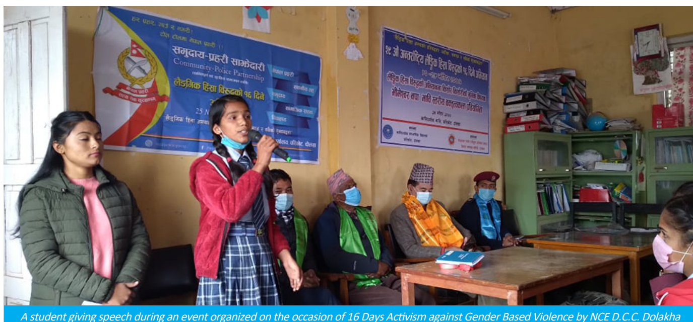
A student giving speech during an event organized on the occasion of 16 Days Activism against Gender Based Violence by NCE D.C.C. Dolakha