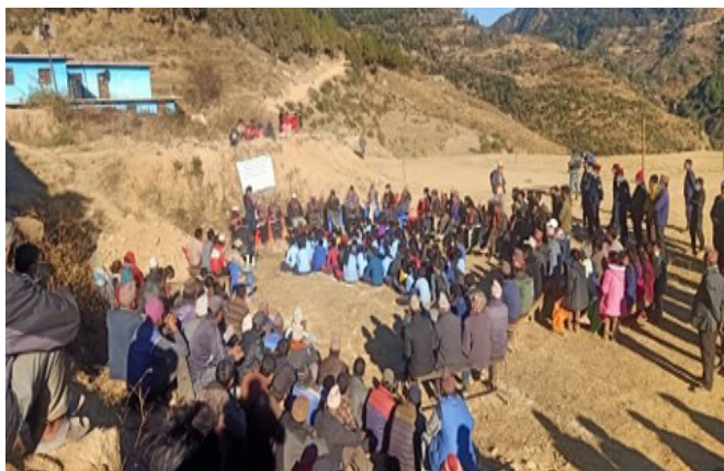
Awareness Raising Program on Gender Based Violence- NCE D.C.C. Bajura

Education plays a major role in combating any violence issues in the society. Lack of proper education and awareness may result to increase in the violence in the society. Thus, with the purpose of discussing on issues of gender based violence prevalent in the society and how the children, youths and adults can be empowered to fight against these practices, NCE Dolakha and Nawalpur have organized interaction program on legal provision and practical challenges of addressing the gender based violence, workshop related to menstrual health awareness and speech competition on the role of children and youth for fighting against such violences. These events were organized on the occasion of 16 Days of Activism Against the Gender Based Violence. Similarly, in Achham, Kailali and Bajura the interaction programs on women violence, safe learning and the impact of alcohol on women violence and learning of children were organized. These programs have helped to draw the attention of concerned stakeholders regarding the situation of violence against children, women and girls during the pandemic and make necessary actions to address them from the community level. The programs were also instrumental in bringing awareness on women related violence along with spreading the message that violence should not be tolerated.