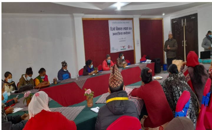
Discussion on SDG 4.7 – NCE D.C.C. Kailali

Orientation and discussion programs on SDG 4.7 were conducted in Bajura, Kailali and Achham districts for localization of SDG 4.7 targets and empowering local government and CSOs on it. The participants discussed on how the local governments could incorporate the targets in its plans and policies and what initiatives could be taken for the attainment of SDG 4. The participants stressed that the educational rights of children must be ensured during the pandemic and inclusive education should be given importance for quality life, poverty reduction and for bringing socio-economic uniformity from the community level.