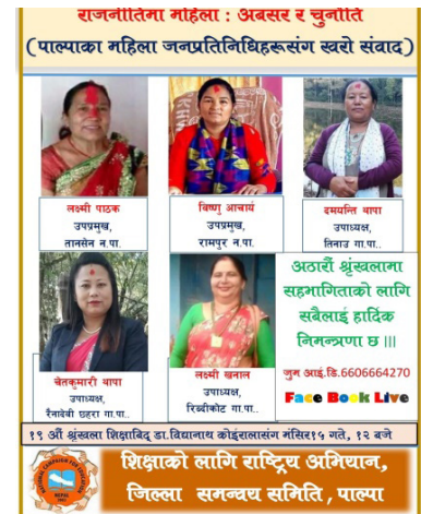
Interaction with the female local level representatives - NCE D.C.C. Palpa