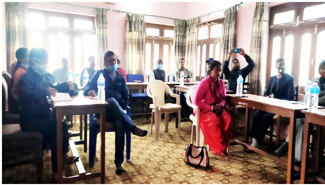
Participants discuss on the role of youths in the educational campaign - NCE D.C.C. Parsa

The youths need to be capacitated to engage and ensure their participation in the campaign for public education strengthening in Nepal. Hence, with that purpose, NCE district coalitions Palpa, Parsa and Parbat have conducted orientation to the youths for ensuring their participation in the educational campaign. The programs helped to identify the local education issues like lack of child friendly behavior in schools, technology-friendly education, investment in education, teachers' training, politics in education as well as the role of youths in addressing these issues. The youths also prepared an action plan for their further engagement in educational activities of their community which included discussion with the education stakeholders and visiting the schools in their community for necessary support.