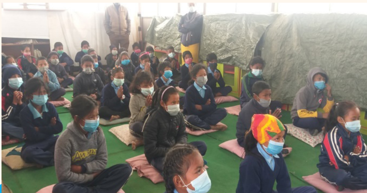
Awareness raising program related to corona virus organized by the youths of Dukuchhap

The youths of Dukuchhap community in Lalitpur district have proactively engaged in community level awareness raising programs like orientation on menstrual hygiene for youth and women in the Danuwar community, addressing the issues of drug abuse and mental health problems. Youths also initiated the sanitation campaign through stone tap cleaning program. Furthermore, for generating awareness regarding COVID-19 and its preventive measures to small children, the youths organized COVID-19 awareness raising programs in public schools of the community and appealed the government for safe learning. These youths were