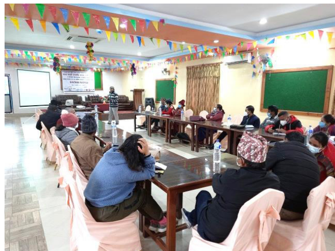
Meeting with the stakeholders- NCE D.C.C. Surkhet

The 72 nd International Human Rights Day was celebrated as a massive campaign of NCE Nepal in 23 districts with a collective theme and advocacy message to establish education as a human right and ensure the educational rights of the children during the pandemic. District coordination committees and member organizations in Udaypur, Bara, Siraha, Parsa, Dhanusha, Makwanpur, Chitwan, Sindhupalchowk, Dolakha, Nawalpur, Parbat, Banke, Lamjung, Dang, Dailekh, Surkhet, Kapilvastu, Palpa, Kalikot, Doti, Bajura, Kailali and Achham organized various interaction programs, policy dialogues and meetings at the district and local levels to discuss on the situation of children and education from the perspective of human rights, on issues of gender equality and violence, initiatives taken by the local governments for ensuring the educational rights during the pandemic, further improvement strategies for educational transformation etc. Diverse group of participants from local level representatives, educational stakeholders, municipal education committee, human rights activists and its networks, journalists groups, civil society organizations, child rights activists was made during the programs. Local government representatives were made accountable on the procedure of school reopening and its monitoring mechanism, political interventions at public schools, and the overall situation of child rights, education and violence against children in the district.