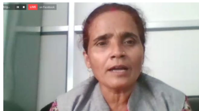
Chairperson of Hupsekot Rural Municipality, Nawalpur sharing the initiatives of the local government