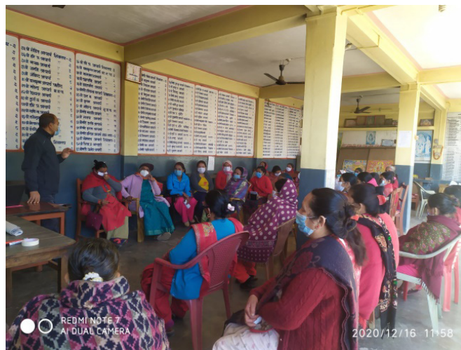
Interaction on ALE - NCE D.C.C. Parbat

Adult Learning and Education is limited in literacy and is the least priority agenda of the local government. Lifelong learning opportunities for bringing equitable and inclusive education should be promoted. Hence, generating awareness for prioritizing on the issues of ALE and related acts and policies the interaction programs were organized in Parsa, Palpa, Parbat, Nawalpur, Kailali, Bajura and Achham.