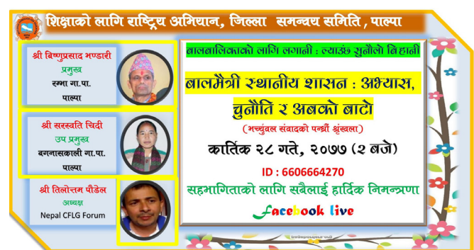
Online Discourse Program - NCE D.C.C. Palpa

Education during emergencies, education financing with local resource management, teachers management, youth empowerment, availability of local opportunities for income generation, Child Friendly Local Governance (CFLG) etc. were the major themes of discussion during the online discourse organized by NCE Palpa, Parsa and Dailekh district coordination committees. There was an active participation of representatives from Education Development and Coordination Unit (EDCU), education focal person from the local governments, local level representatives, youth leaders, school management committees, head teachers, teacher associations, Child Helpline, Child