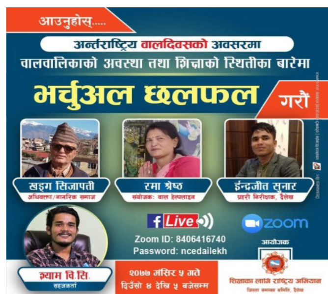
Online Discourse Program on International Children's Day - NCE D.C.C. Dailekh

With the coordination of local governments and various civil society organizations, NCE District Coordination Committee Palpa and Dailekh have organized virtual dialogues with the stakeholders on the occasion of 31 st International Child Rights Day so as to discuss on the educational status of children, child rights, child related violence in the district, implementation status of policies related to children in the districts, child friendly environment, etc. The role of the stakeholders in the program was also discussed along with their commitment for cooperation and collaboration for promoting child rights.