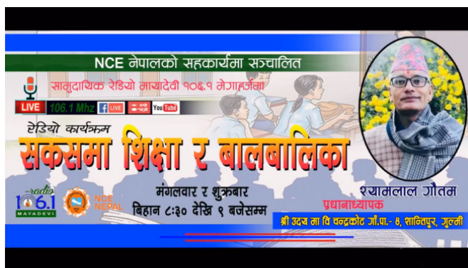
Radio Dialogue Program - NCE D.C.C Kapilvastu

NCE District Coordination Committees Palpa, Nawalpur, Kapilvastu, Dhanusha, Makwanpur, Dailkeh and Bajura, conducted 66 radio dialogues with the stakeholders for ensuring learning during the pandemic and public education strengthening. The civil society organizations advocated on important